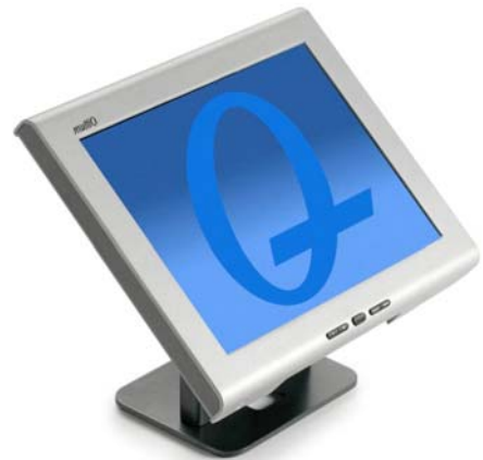
MQ212 is a 12" LCD-screen

Metal housing and protective glass gives MQ212 a unique durability even in the most demanding environments.